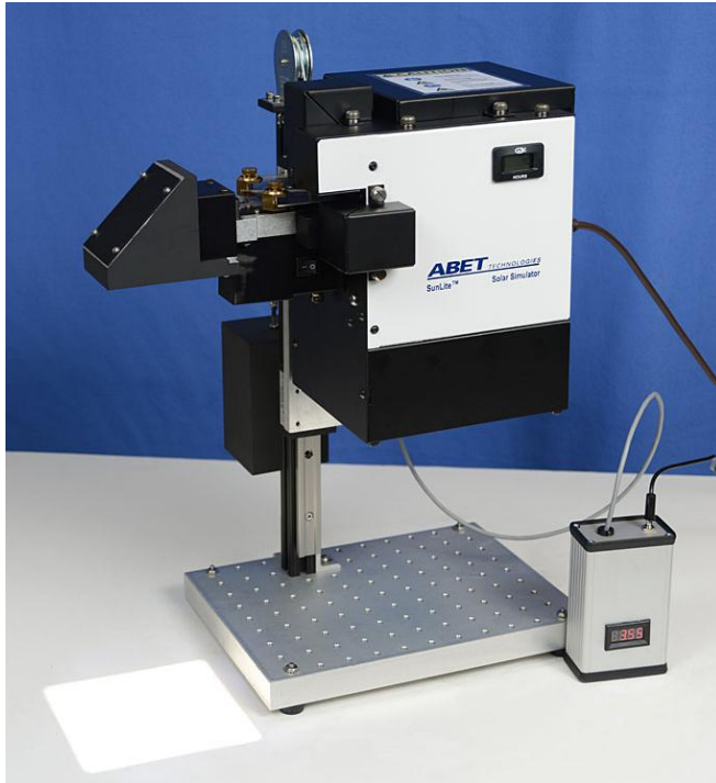
Abet Technologies' Model 11002 SunLite™ Solar Simulator with the 15278 option for infinitely and reproducibly adjustable irradiance control as well as the 15279 electronic shutter option.