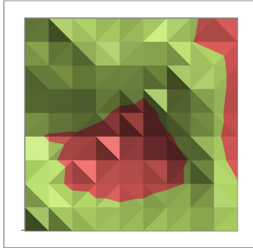
Typical non-uniformity map of an Abet Technologies model 11002 SunLite™ Solar Simulator, 50x50 mm; <5% standard; <3% JIS model.

Typical attenuation behavior of the 11002 SunLite™ Solar Simulator using the model 15279 option.