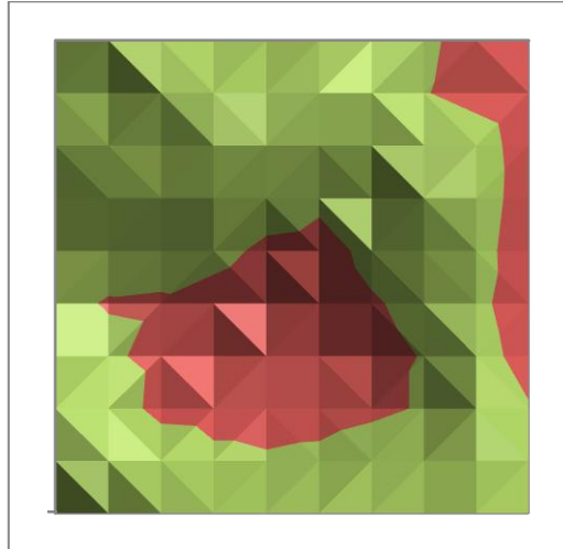
Typical non-uniformity map of an Abet Technologies model 11002 SunLite™ Solar Simulator, 50x50 mm; <5% standard; <3% JIS model.